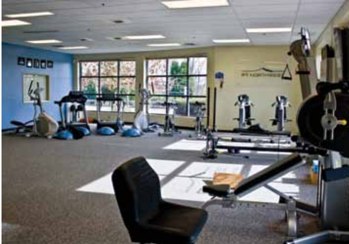
PT Northwest | Corvallis